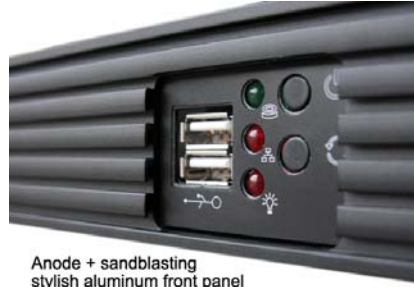
Anode + sandblasting stylish aluminum front panel